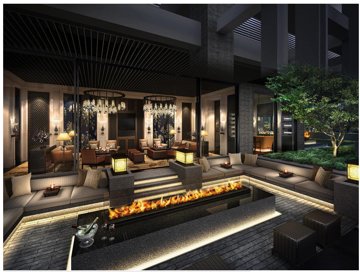
The hotel's FLAIR rooftop restaurant & bar (artist's rendering)