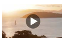
Experts at ILTM Cannes Emphasize the Importance of Experience for Luxury Travelers [VIDEO]